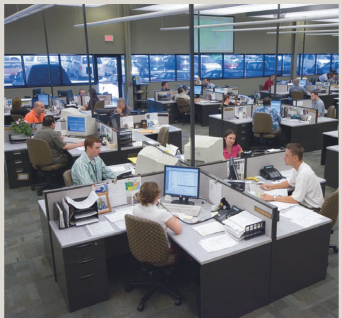
Bison's ABL (Asset Based Logistics) Center in Winnipeg, Manitoba Canada.